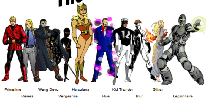
Primetime Raines Wang Dewu Vengeance Herculena Hive Kid Thunder Blur Legonnaire