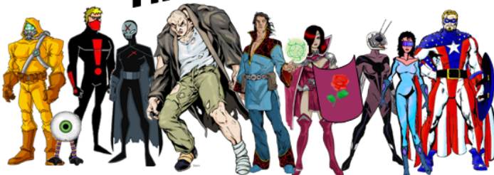
Anxiety Wildoore Monsta Shaman Shield Maiden The Bug Diva Allegiance